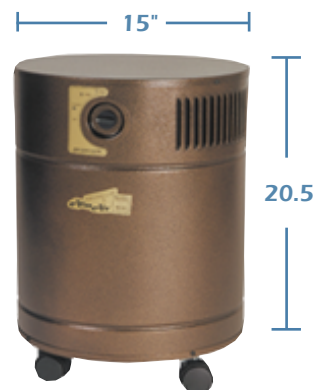
Shipping Weight: 50 lbs

Invest in the health of your family with the AllerAir 5000 Vocab